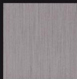
1588 | silver metal scratch