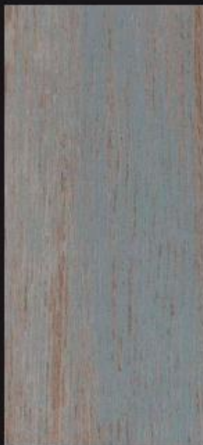
1564 | blue reclaimed wood