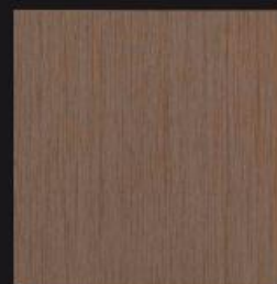
1582 | rust metal scratch