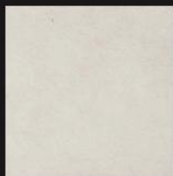
1508 | white sand