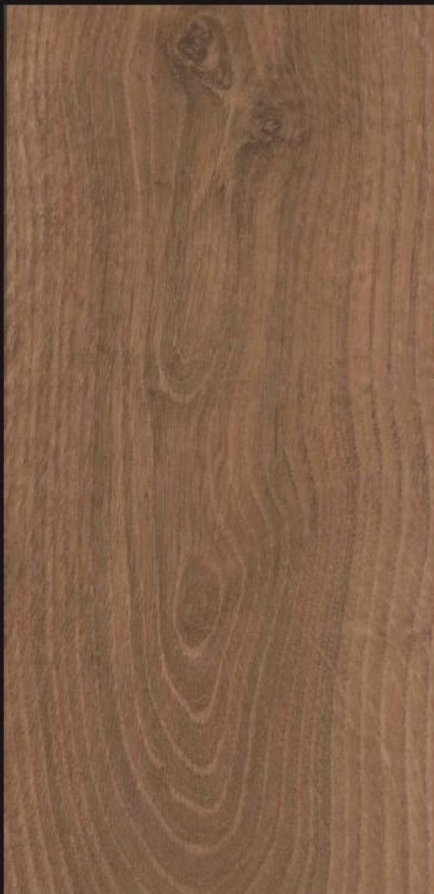
1670 | deep country oak