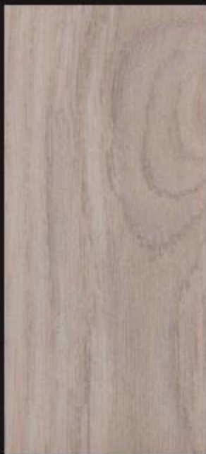
1556 | white weathered oak