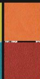
1542 | red