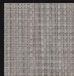
1586 | bleached textile