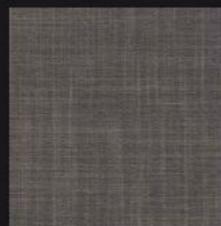
1644 | graphite warm