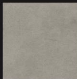
1622 | natural concrete