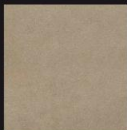
1500 | camel sand