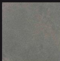
1622 | grigio concrete