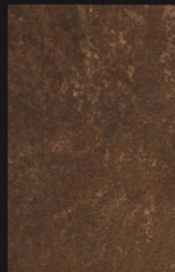
1524 | rusty oxidized steel