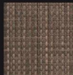
1584 | colored textile