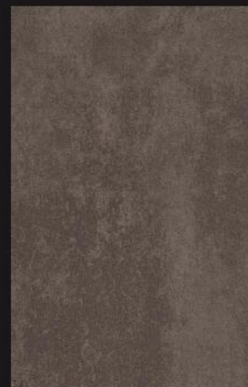
1578 | warm metal