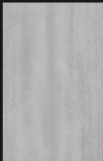
1512 | grey limestone