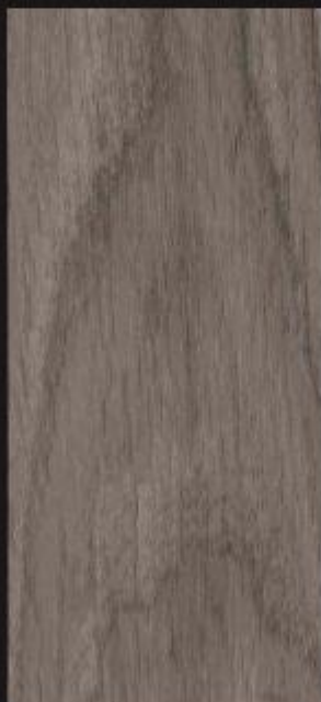
1638 | rustic antler oak