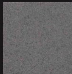
1604 | coal sand