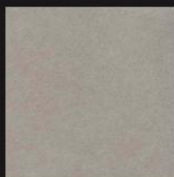
1508 | silver sand