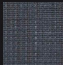
1586 | indigo textile