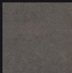
1624 | nero concrete