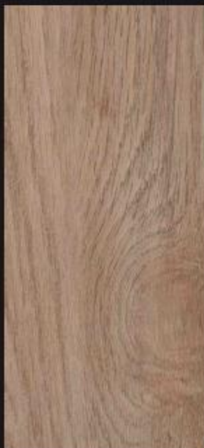
1627 | natural weathered oak