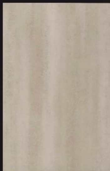
1516 | desert limestone